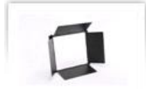
4-leaf barndoor 660