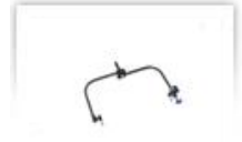
Pole operated yoke 440/660