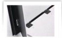
4-leaf barndoor 660 reflective