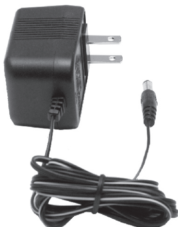
(Adapter) 115V: SP-115 230V: SP-230