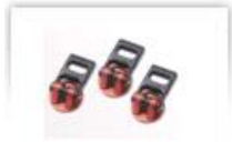
Rubber feet 100/150