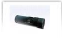
Cover EFP 2