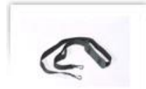
Carrying strap ENG 2