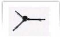
Mid-level spreader 100/150