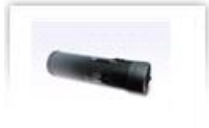
Cover 150 II