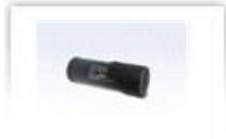
Cover 150 SE