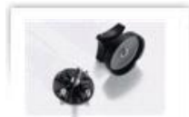
Ball adapter with screw