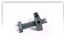
Cable clamp V 60