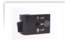
Accessory adapter with clamping