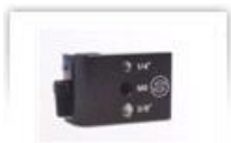
Accessory adapter with clamping