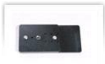
C.O.G. plate 16