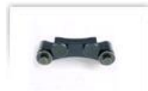
Front Box Adapter